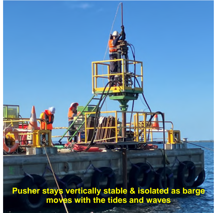
Pusher stays vertically stable & isolated as barge moves with the tides and waves