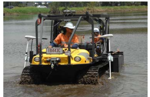
motoring across the water - easy