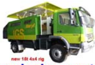
new 18t 4x4 rig reducing geotechnical uncertainty