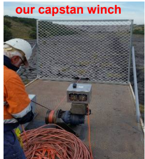
our capstan winch

The outcome: a number of CPTu tests were successfully done to depths up to 25m and pore pressure dissipation tests were run the test data supported the access method employed for the very soft site the crust was very thin and the stuff below was very very very soft (a proper geo-description)