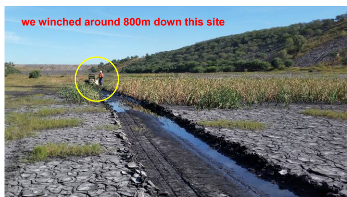
we winched around 800m down this site

Step 1: our skid-mounted rig Baby Jayne is purpose ballasted to 3t mass using lead weights* applied ground pressure is only 9.6kPa but still the surface indents markedly