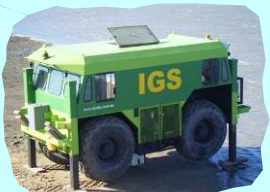
Beryl – 15t 4 wheel drive