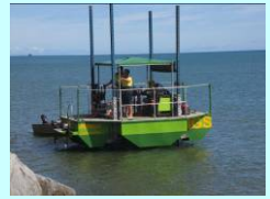
Little Jack - anywhere