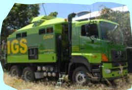
Baby Jayne – 15t portable