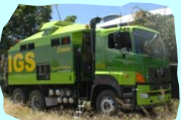
Baby Jayne – 15t portable