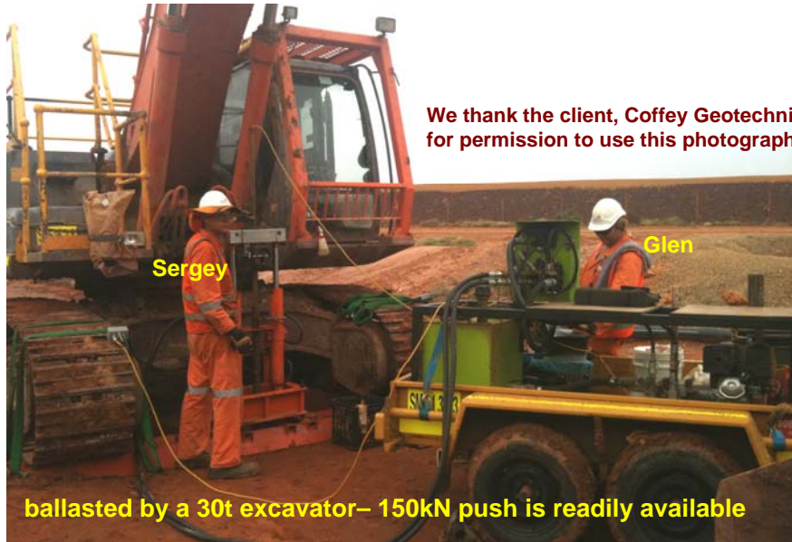
We thank the client, Coffey Geotechnics, for permission to use this photograph