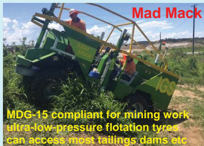
MDG-15 compliant for mining work ultra-low-pressure flotation tyres can access most tailings dams etc