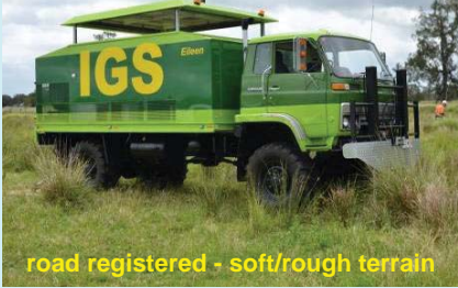
road registered - soft/rough terrain