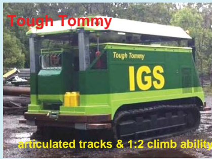
articulated tracks & 1:2 climb ability