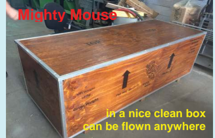
in a nice clean box can be flown anywhere