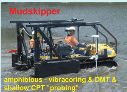
amphibious - vibracoring & DMT & shallow CPT "probing"