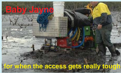
for when the access gets really tough!