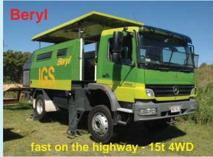
fast on the highway - 15t 4WD