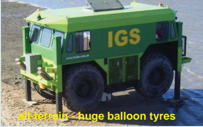
all terrain - huge balloon tyres