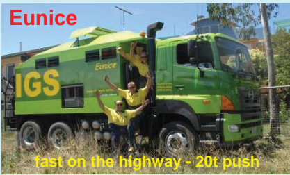
fast on the highway - 20t push