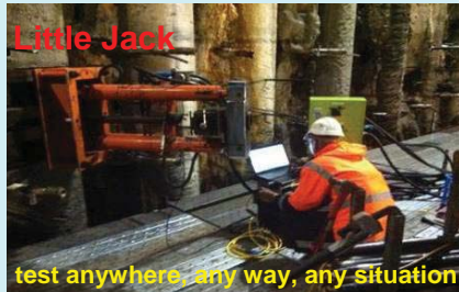
test anywhere, any way, any situation