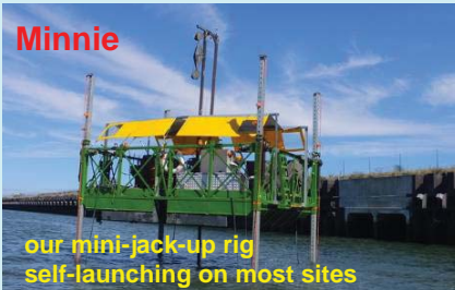
our mini-jack-up rig self-launching on most sites