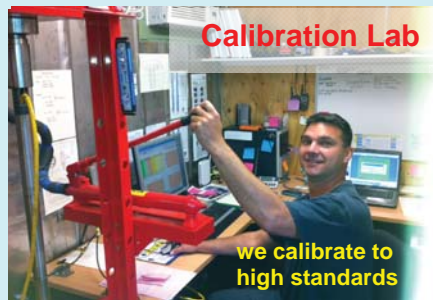
we calibrate to high standards